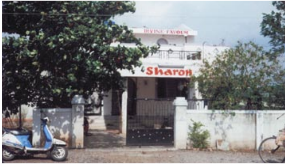
Here is the current residence for children at Pumpkin House India. Efforts are underway to raise funds for a new home.