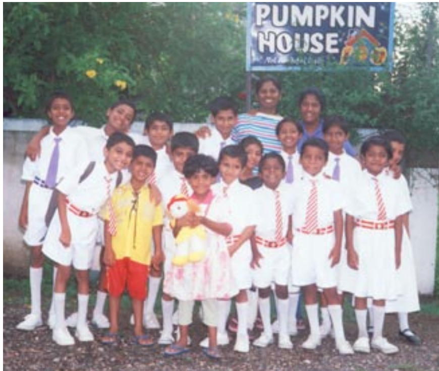
Pumpkin House India residents pose for a photograph in their school clothes.

poet Hafiz. The board of directors has received other financial contributions from individuals and will soon begin to explore the prospects for grant funding.